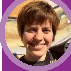
Meppie, E Commerce

This hummus is about as soft and luxurious as hummus could be. It's a great local on-the-go addition to summer picnics and cloud-watching lunches.