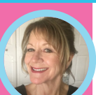
Barbara General Merchandise

Evan Healy Rose Serum and Rose Petal Hydrosol These two products used together are the best moisturizer I have ever used. My skin has never looked so good.